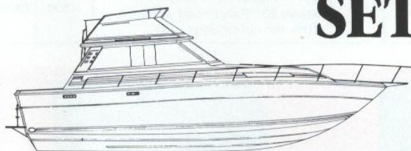
Westerbeke 8.0 generator standard equipment in SEARAY 360 SPORTFISH

The smallest, quietest, most advanced generator for all ship-board needs; 120 or 120/240 volt electrical power at the turn of a switch for electric cooking, refrigeration, air conditioning, cabin appliances, power tools, and navigation/communication equipment. Like all Westerbeke generator sets, it is fresh water cooled through an engine-mounted heat exchanger. The complete unit is mounted on lightweight rails through soft flexible isolator mounts to prevent vibration. A lightweight removable drip tray is fitted under the unit between the mounting rails. The engine is equipped with an electric fuel pump and self bleeding fuel system.